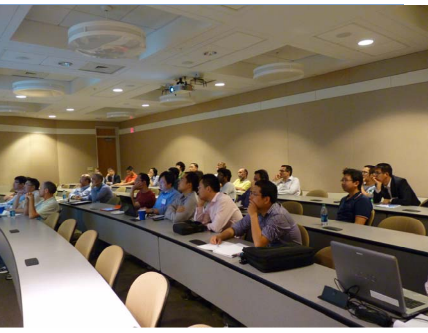
A total of 37 people, including 31 IEEE members, attended the lecture