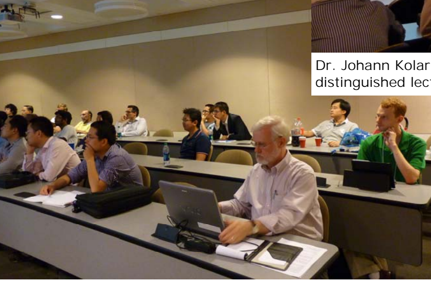
Members from the IEEE ENCS Executive Committee also attended the PELS distinguished lecture